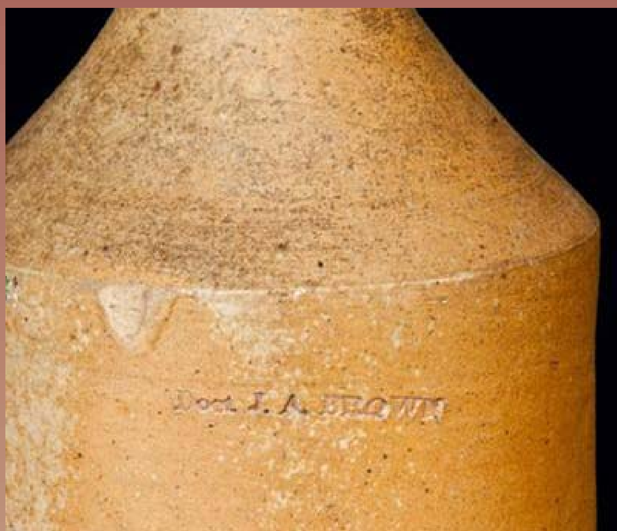
Close-up of the name Dr. J. A. Brown stamped onto another bottle similar to the mended bottle found in privy.

F or people with tuberculosis, some symptoms include coughing, weight loss, fevers, night sweats, coughing up blood, chest pain and fatigue. Until the development of antibiotics in the 1940s, patients with tuberculosis just had to live with the symptoms and pray that the available tuberculosis remedies would help to give relief.